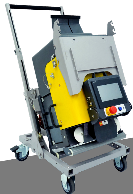
X-Pad+ Mobile for easily demonstration in clients' warehouse